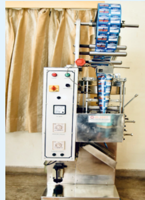
Pouch filling and sealing machine