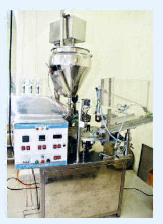
Automatic tube filling, sealing and coding machine