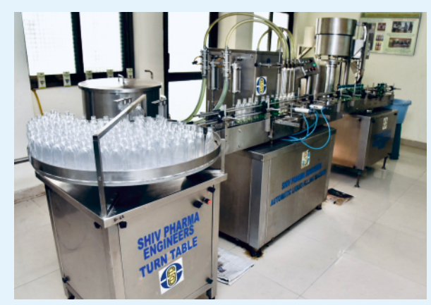
Liquid filling and cap sealing machine