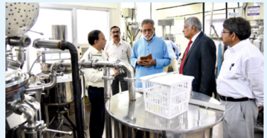
Interaction with VIP Visitors at TBIC