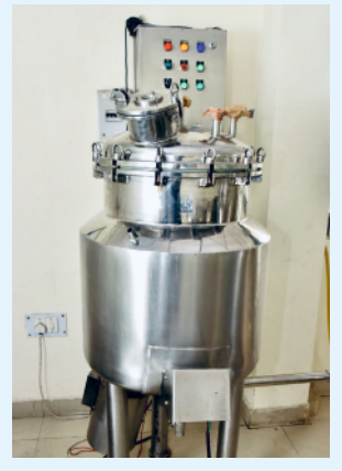
Liquid manufacturing unit