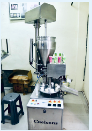
Semi-automatic tube filling, sealing & coding machine