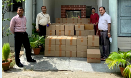
Products manufactured at TBIC ready for despatch